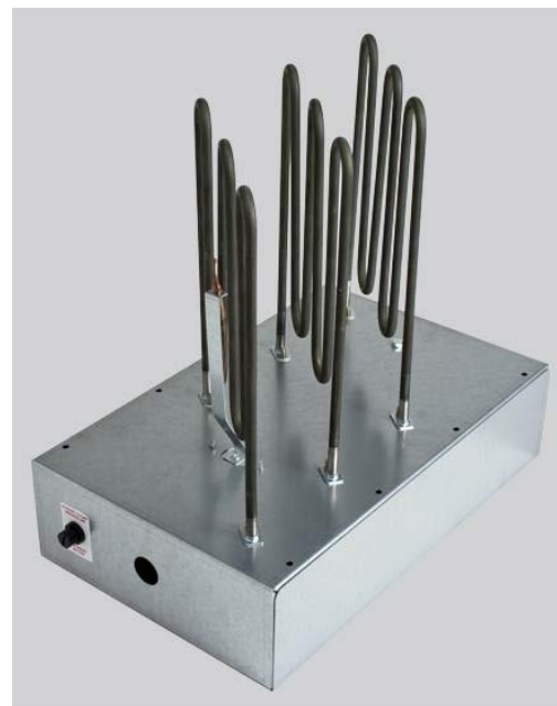
Fig 3 – Typical Heater Battery and Control Panel

BWF's drawing as per reference number in title page will show the location and type of any heater battery fitted.