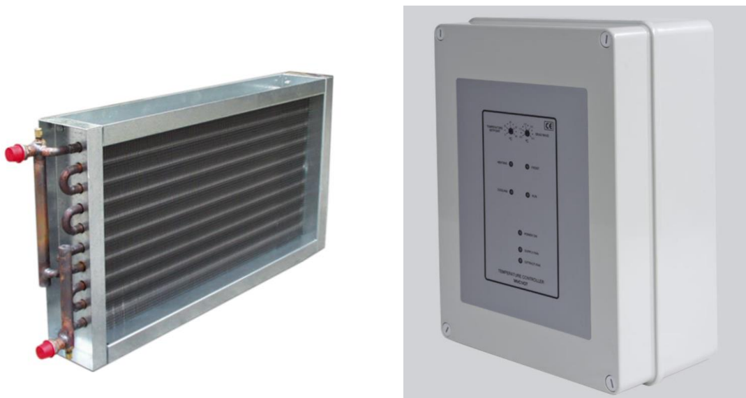
Fig 3 – Typical LPHW Coil (fitted in duct) with Control Panel

BWF's drawing as per reference number in title page will show the location and type of any heater battery fitted.